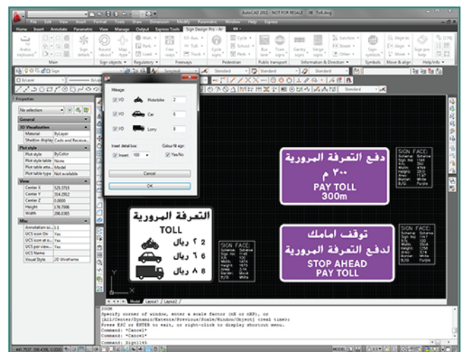
▲ Selection of Toll signs.

Waiting signs in S.D.P.Ar allow the user to change every aspect of the sign face including; Time, days, symbols and arrows. The sign is also changed if the direction of the arrows are activated so the user can