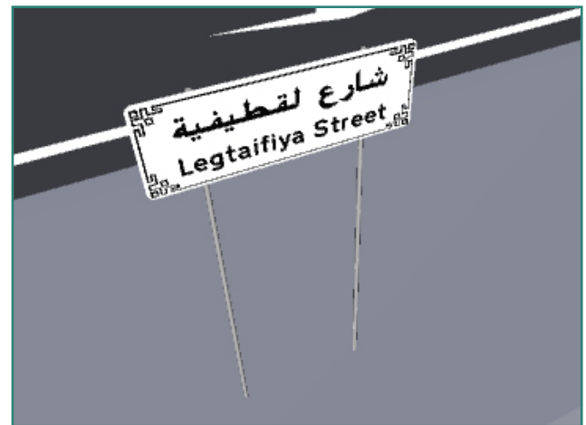
▲ Local street signs converted to 3D.