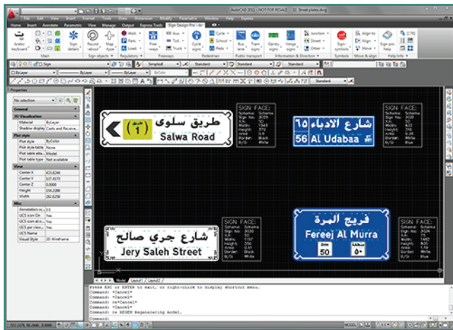
▲ Local street signs.